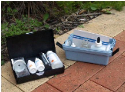
Field test kits for alkalinity (left) and acidity (right).

Groundwater can contain substances such as ferrous iron which when exposed to air can lead to further acidification of water. These stores of potential acid can not be detected with a pH meter therefore a separate test for acidity is required.