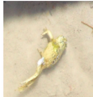
Acid groundwater effects on amphibians

These tests measure acidity levels using a simple field titration technique. Groundwater can also contain substances that can buffer or prevent the groundwater from going acidic. The buffering capacity of the groundwater is determined by measuring the alkalinity of the groundwater. Alkalinity is also measured by a simple field titration technique. These field tests will usually quote acidity and alkalinity as milligrams per litre calcium carbonate (mg/L CaCO 3 ). These field tests provide a quick and simple method to determine if the groundwater will become acidic if it has not already done so. If you subtract the acidity value from the alkalinity value and it gives a positive figure, it indicates that the buffering capacity is greater than the acidity store and the groundwater will not become acidic. However, if subtracting acidity value from the alkalinity value results in a negative value then the groundwater will likely become acidic. Please note to ensure that the acidity and alkalinity tests have the same units before trying to compare or subtracting results.