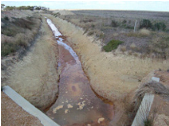
Iron coloured slime in the water is a good indicator of acidic conditions

Key indicators are bare ground, iron stains on the ground and slimes in water (see photos).