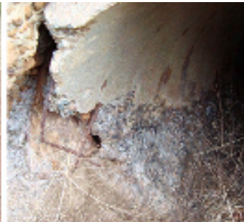
Acid groundwater effects on road culvert