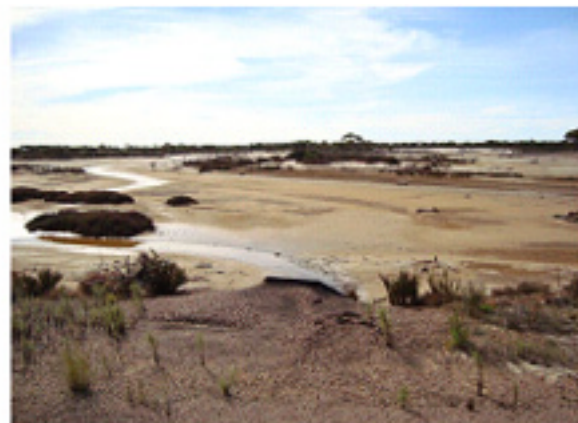
Acid groundwater with salinity prevents natural saltland regeneration processes